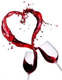
Table for Two