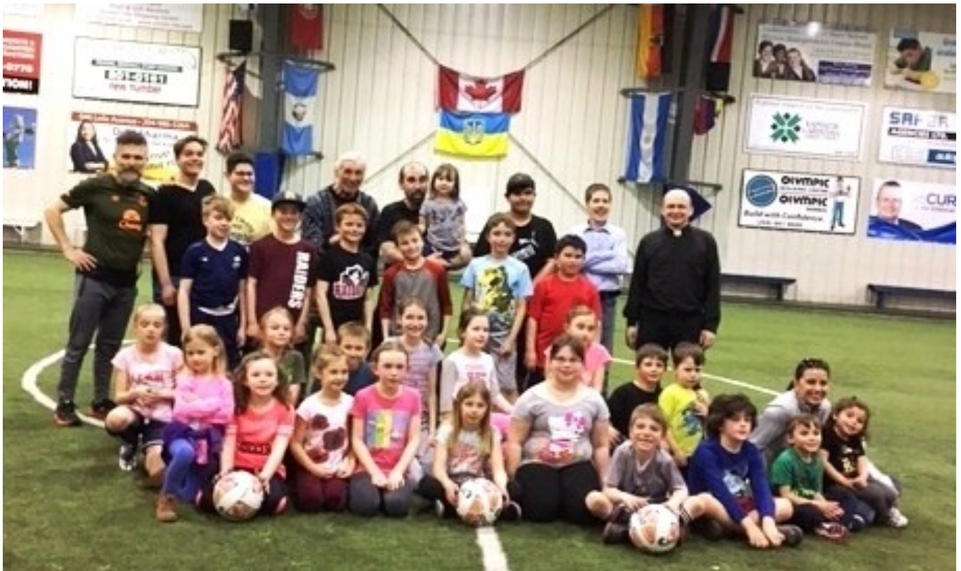
Winter Games Indoor Soccer April 14, 2018