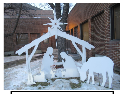
Nativity Scene at Seven Oaks Hospital