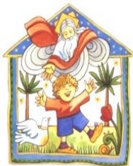
A CATECHISM FOR CHILDREN

We are currently collecting information regarding numbers of students for this year's catechism program. Please email catechism.stjosephukr@gmail.com with the following information: Child's Name, Age, Catechism Grade This Year, Parent Name(s), Email(s) to be contacted at.